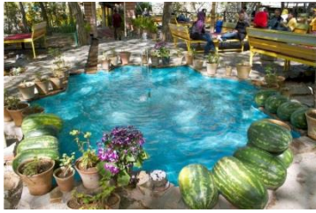
Day 14, TEHRAN

Transfer to the airport for the return flight.