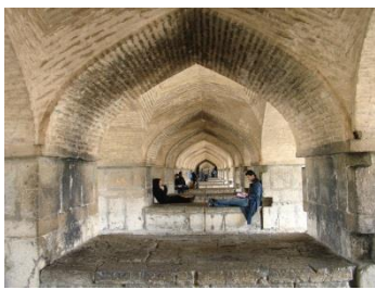
Day 13, Isfahan - Tehran