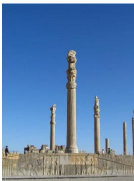
Day 8, Shiraz

An unforgettable excursion, to Persepolis , "Ancient Capital of the Achaemenian Kings" established by Darius I in the late 6th century BC. it is known today in Iran as Takht-e Jamshid ("Throne of Jamshid") after a legendary king. The Greeks called it Persepolis.