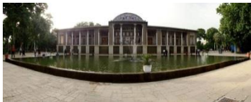
Day 7, Kerman - Shiraz

Return to Kerman where we overnight at the Hotel.