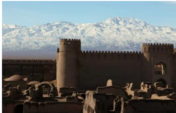
Day 6, Kerman - Mahan - Rayan